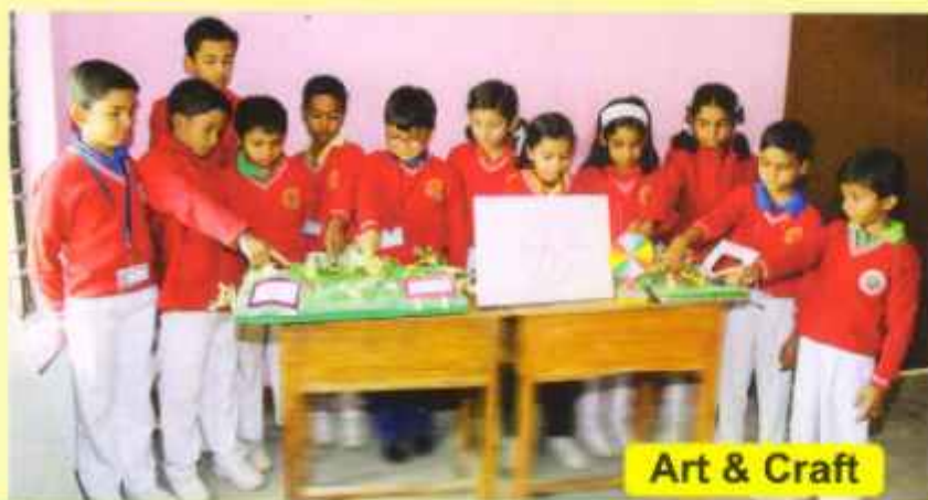
Art & Craft

The motto of the school is Discipline and Justice. The acquisition of knowledge in the process of dispelling ignorance, Kapil Ganga Public School seeks constantly to equip the children with all the essential qualities of an all rounder.